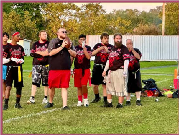
ROSS COUNTY TRAILBLAZER FOOTBALL

In October, the Fall Special Olympics will be held in Geneva, Ohio. The competition will be held at the Spire Institute on October 18, 19, and 20. Good luck to everyone involved!