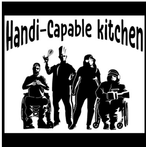
HANDI-CAPABLE KITCHEN LOGO